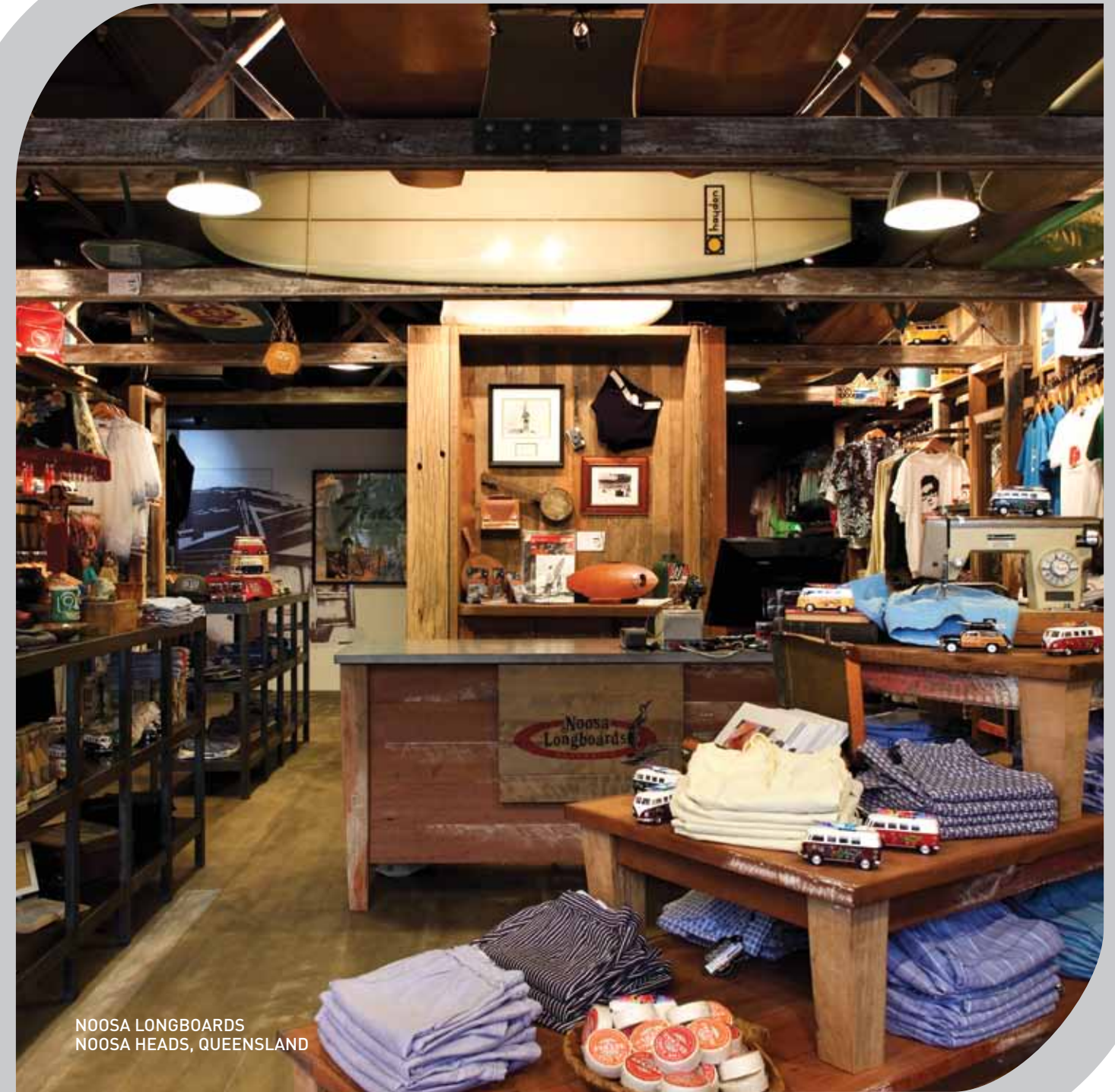
NOOSA LONGBOARDS NOOSA HEADS, QUEENSLAND