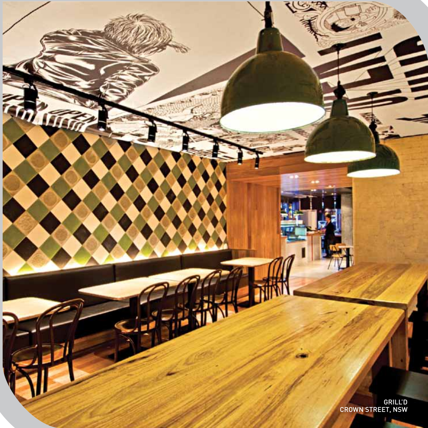
GRILL'D CROWN STREET, NSW

OUR VAST NETWORK ENABLES US TO SOURCE THE BEST IN QUALITY AND IN PRICE ACCORDING TO BUDGET AND LOCATION