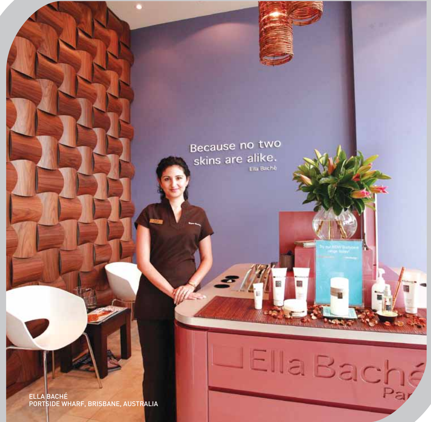
ELLA BACHÉ PORTSIDE WHARF, BRISBANE, AUSTRALIA