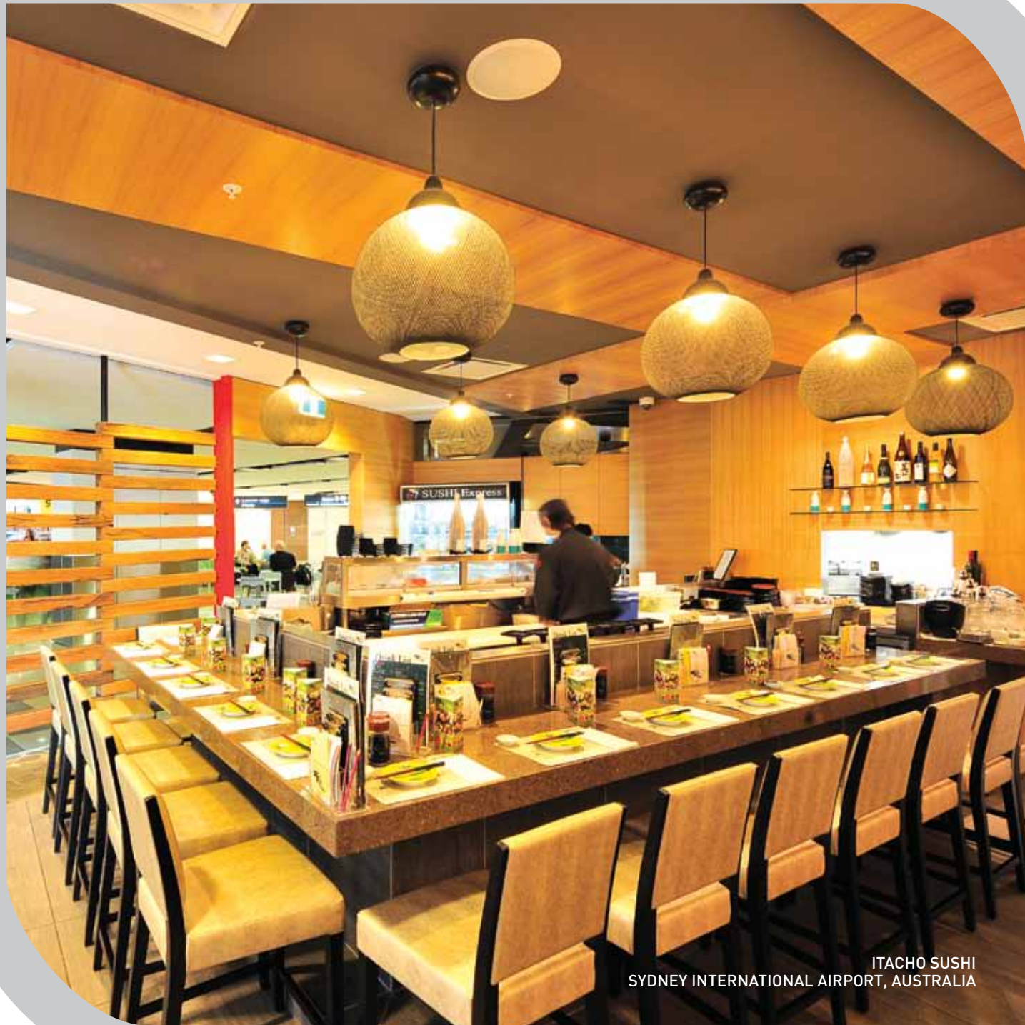
ITACHO SUSHI SYDNEY INTERNATIONAL AIRPORT, AUSTRALIA