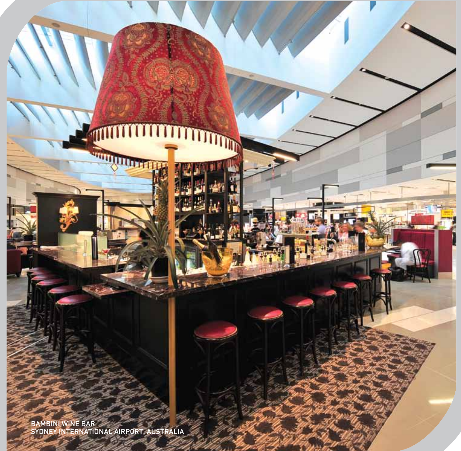
BAMBINI WINE BAR SYDNEY INTERNATIONAL AIRPORT, AUSTRALIA